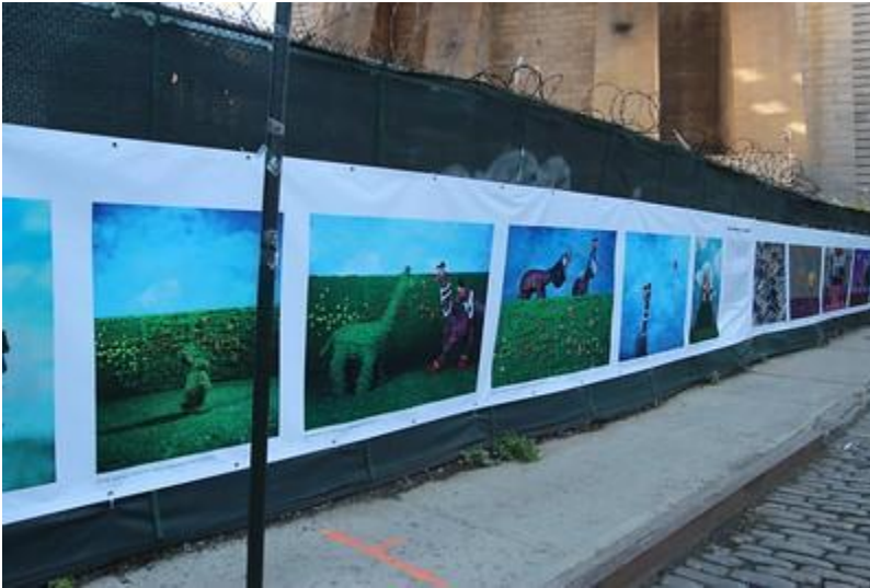
("Personal Mythologies," Source: NYC DOT)

Artists are encouraged to propose pieces that consider the following: