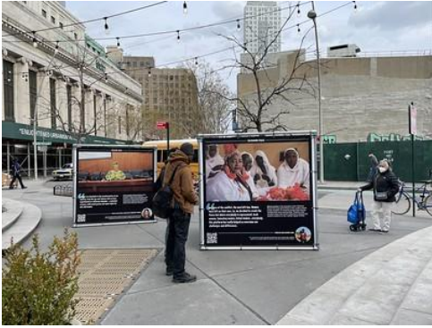
("In Their Hands: Women Taking Ownership of Peace.")