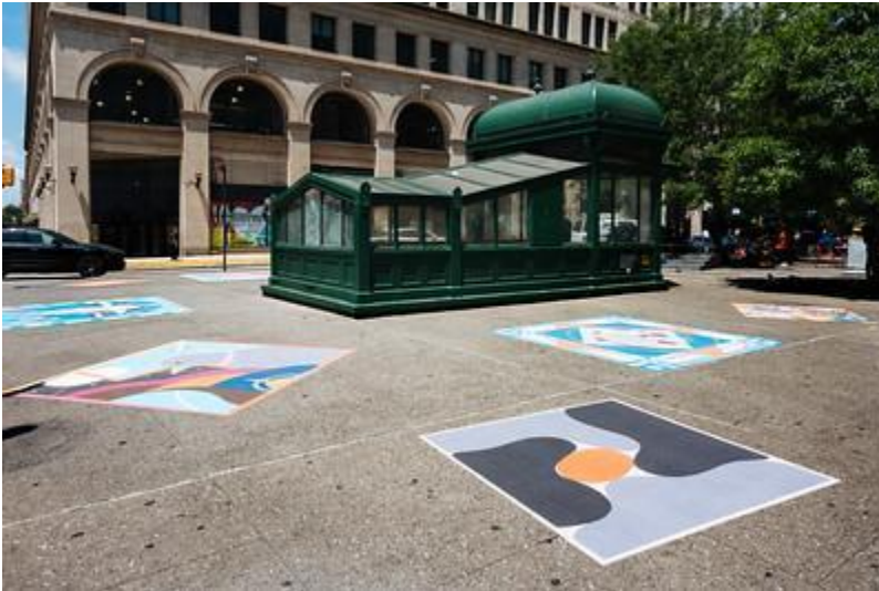
("I am a Stranger and I am Moving," Source: NYC DOT)