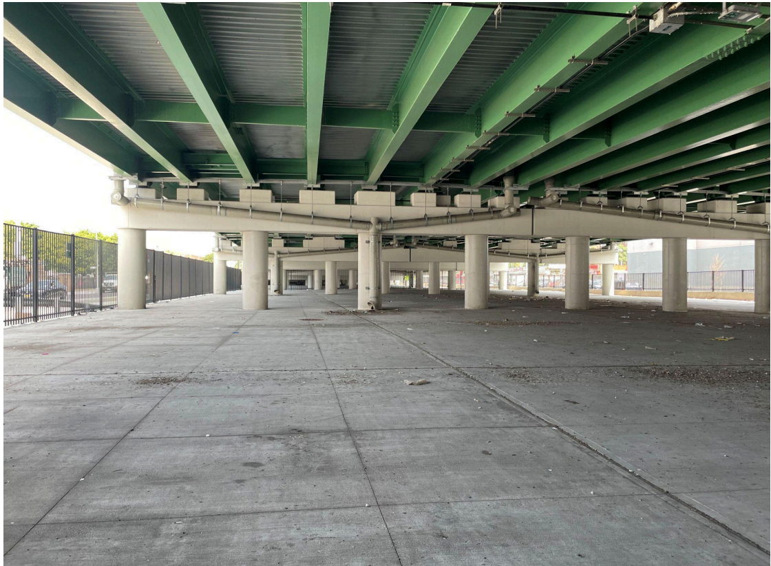
The space between the existing fence and the first row of columns is 7,500 sq. ft.