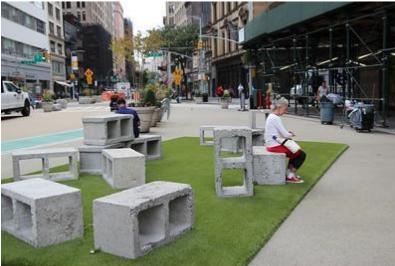
("Social Block")